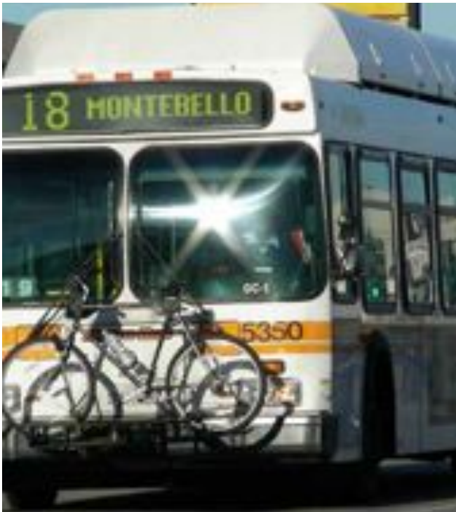
▲ With advances in cleaner fuels, like this bus running in compressed natural gas, public transportation is becoming more efficient and less polluting over time.

is consumed for low-density housing and commercial development;