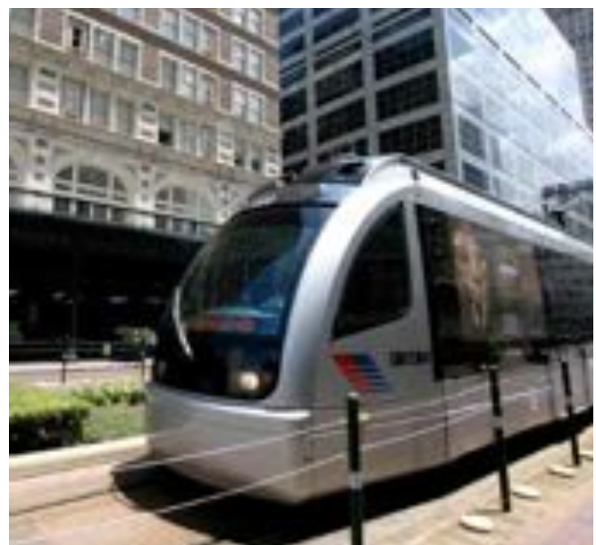
▲ In 2008, light rail had the highest percentage of annual ridership growth among all transit modes—an 8.3 percent increase. (Photo - Houston Light Rail, Ed Schipul.)