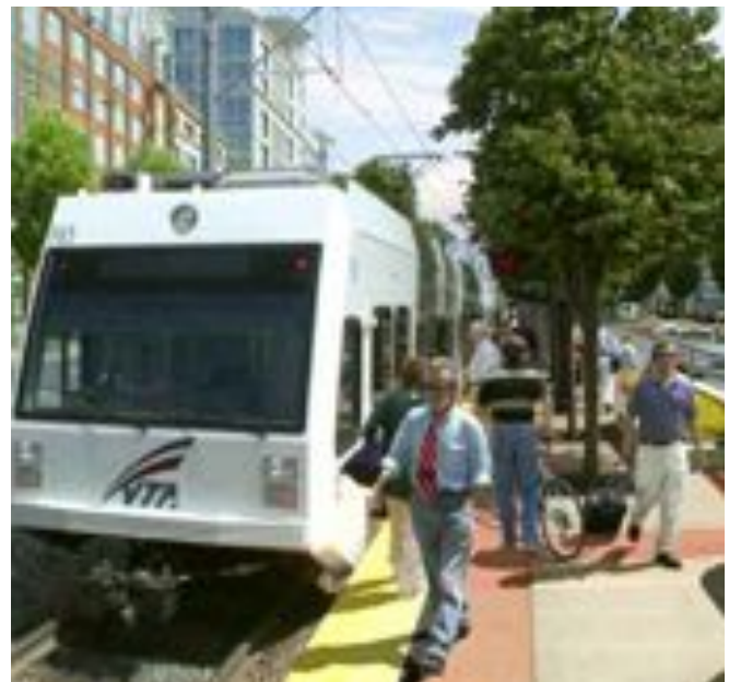
▲ Four in five Americans believe increased investment in public transportation strengthens the economy, saves energy, creates jobs, helps reduce traffic congestion and decreases air pollution.

Existing systems would undergo significant expansion, allowing the largest urban systems to expand heavy rail and grow light rail and bus rapid transit systems linking urban centers and suburban areas. Commuter rail and new high-speed rail