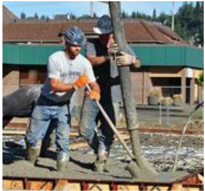
▲ The recent American Recovery and Reinvestment Act, funding projects such as this future transit center in Aberdeen, Washington, has accelerated transit expansion.

By taking these approaches, we can create a future where every American can get to work and school via public transportation—subways, rail, buses, walking, and biking. People are voting with their feet and moving to public transportation in increasing numbers—it is imperative that policy and investments accentuate and accelerate this trend in order to achieve energy independence and solve global warming.