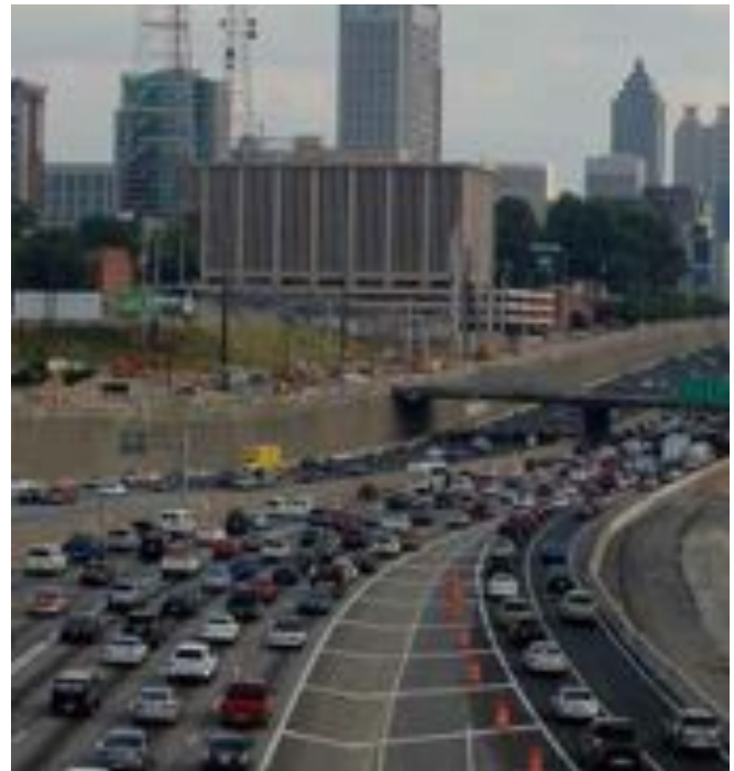
▲ Transportation accounts for about two-thirds of all U.S. oil use—nearly 13 million barrels of oil per day.

Record ridership shows clear, growing demand for public trans-